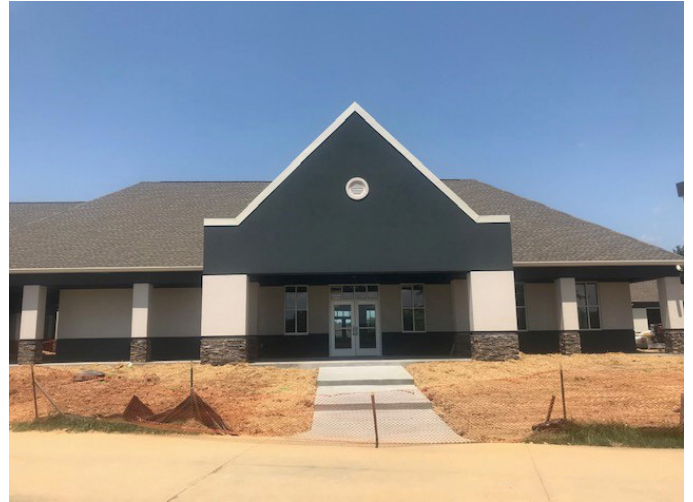
Kahite Community Center