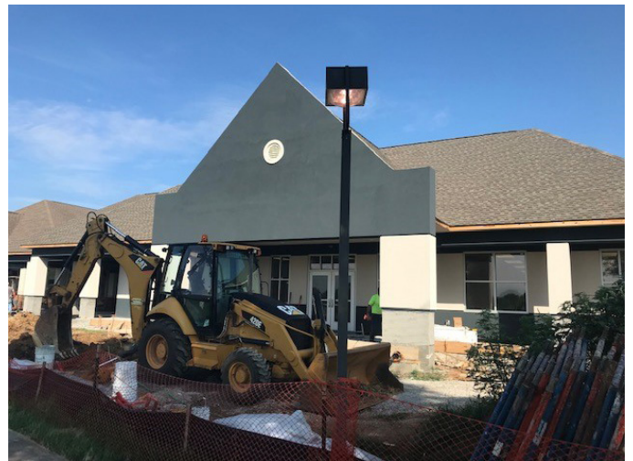
Kahite Community Center