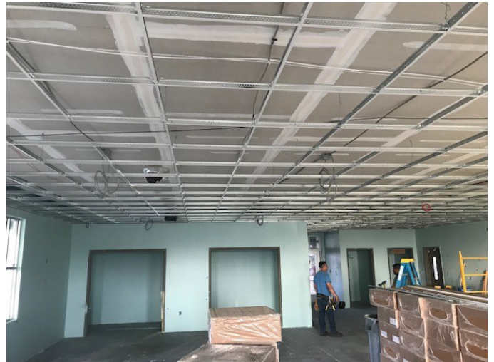
Kahite Community Center