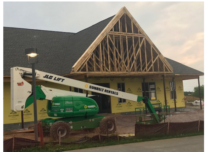
Kahite Community Center