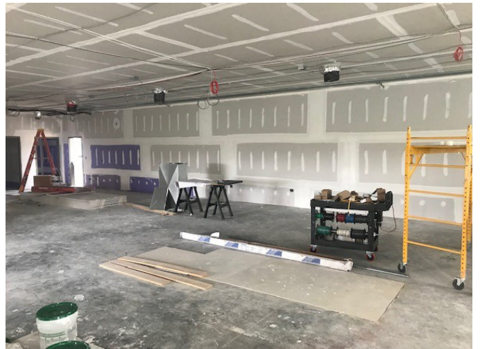
Kahite Community Center