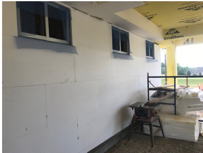
Kahite Community Center