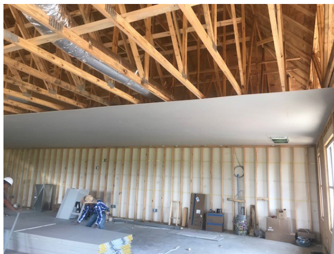
Kahite Community Center