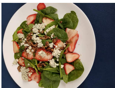
Spinach and Strawberry Salad