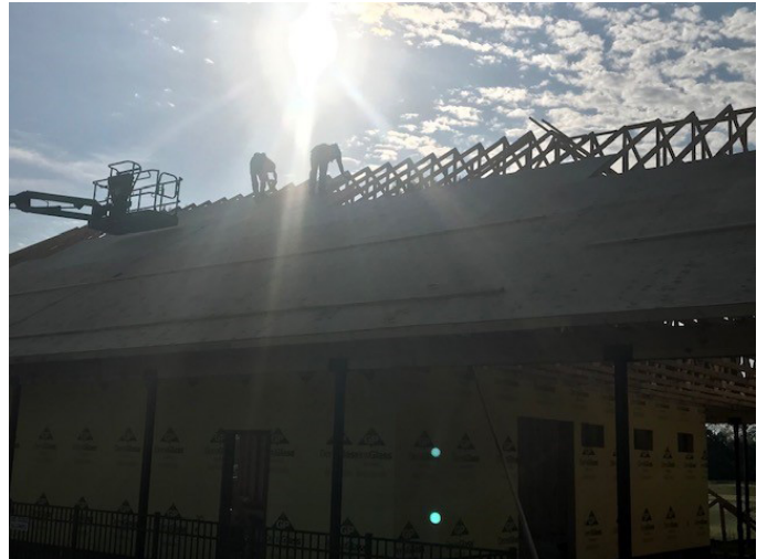
Kahite Community Center