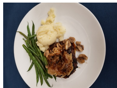
Angus Chopped Steak