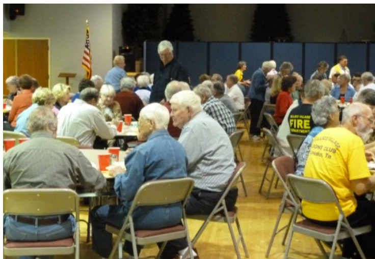
A portion of the crowd enjoying dinner and socializing with friends