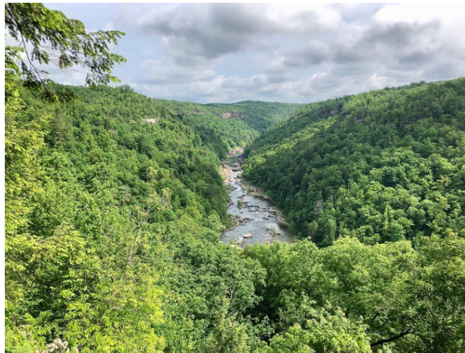
Image is from Honey Creek hike, May 2018.

It's only a 5.6-mile trail on paper, but the hike is an adventure. I isn't a typical walk through the woods or big elevation gain – yet everything about the primitive feeling Honey Creek Loop hike brings fun, including the many names of the different landmarks along the way. Around each corner lies landmarks such as Echo Rock, Boulder House Falls, or Ice Castle Falls, and an enormous rock house called "The Great Room." There will be large boulders to climb over and some to go through, along with a "lookout tower" to climb, plus multiple creek crossings. Located at the south end of Big South Fork National River and Recreation Area, Honey Creek Loop trail is one of the park's most rugged and challenging trails, but this trail offers a little something for everyone. Although it is only 5.6 miles, hiking time will approach 5 hours due to the beautiful scenery, creek crossings, and boulder climbs. Hiking boots and hiking sticks are recommended. Bring water and a trail lunch. Driving directions will be provided the morning of the hike. Carpooling is recommended; passengers are asked to contribute $6 to the driver to help cover gas.