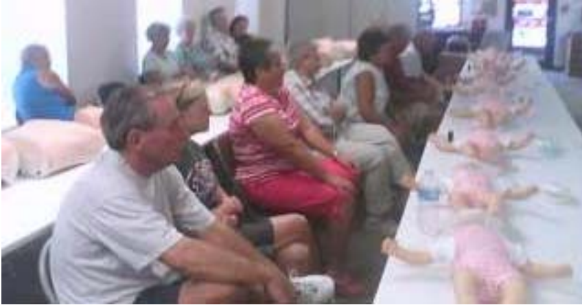
Above: CPR-AED training was recently held for residents by the Tellico Village Volunteer Fire Department. Another example of Villagers helping Villagers!