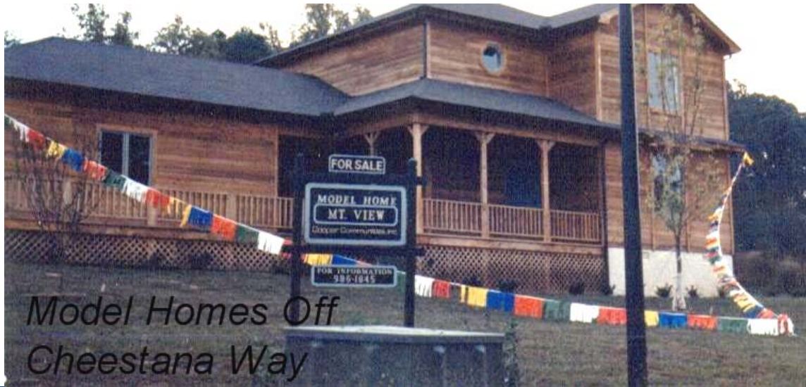
Model Homes Off Cheestana Way