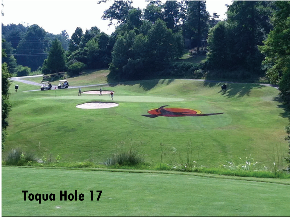
Toqua Hole 17