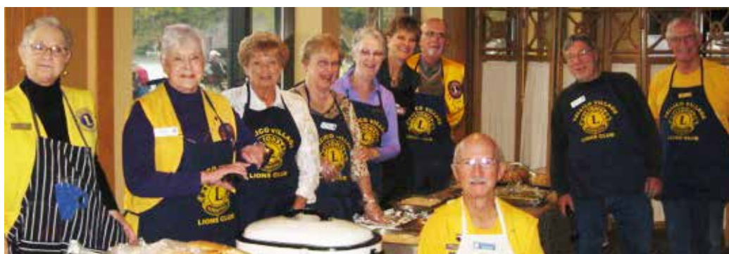
A group of Lions ready to serve their guests!

100% of the profits of the event are used by the Lions to fund a variety of service activities. These include: health fairs at the Good Samaritan and Good Shepherd Centers, free eyeglasses for indigent residents of Loudon County, vision screening in the local schools and day care centers and donations to a number of Village, as well as county-wide and east Tennessee service agencies. As has been done in the past with the exercise stations on the Wellness center walking path, some of the funds will be used to finance another similar project in the Village, the identity of which is in the works. Dust off your lederhosen and dirndl, shine up your polka dancing shoes and you're your neighbors for a great evening.