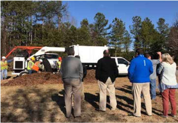
The vacuum truck picking up leaves during the demonstration.