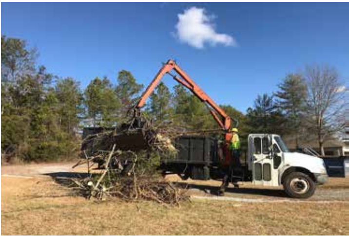
The grapple truck picking up brush at the demonstration.

There is always room to make small improvements, challenge the status quo, and tune processes and practice on an everyday basis. In fact, you probably do this week in, week out without calling it "change" or even "continuous improvement". Over time, all of these incremental changes add up, and make a significant positive impact on your team and the overall POA organization. Here at the POA, we believe every aspect of the organization should, at all times, strive to do what it does better.